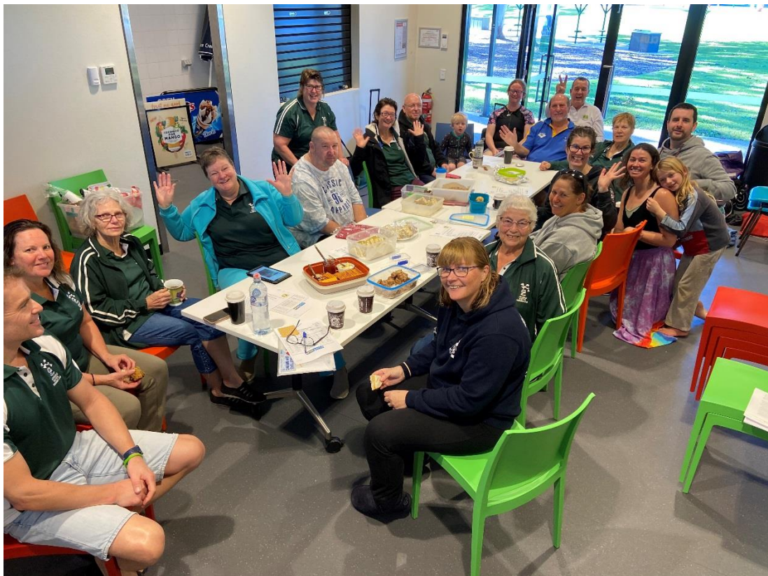
At monthly morning tea after Round 4 Club Championships! Morning Tea is the first Saturday of each month, in the club room which is at the deep end of the 50m pool.